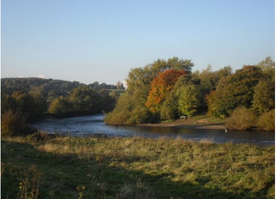
Meeting of the waters – North and South Tyne

encouraging enabling challenging in the Tynedale Methodist Circuit