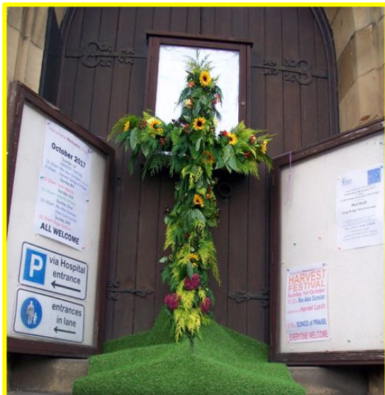
Haltwhistle Chapel's Harvest Cross