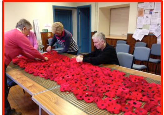
Ladies at Bellingham fastening the hundreds of knitted poppies to the fall. A service was held outside the chapel on Armistice Day.