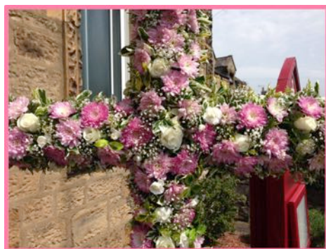
Floral Cross outside Fourstones Chapel (with detail above) for the flower festival celebrating Queen Elizabeth's 90 th . Birthday.