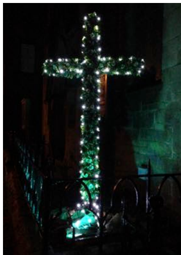
The Christmas Cross made with ivy, conifer and Christmas roses outside the chapel at Bellingham, highlighted with white pea lighting symbolising Jesus as the Light of the World.