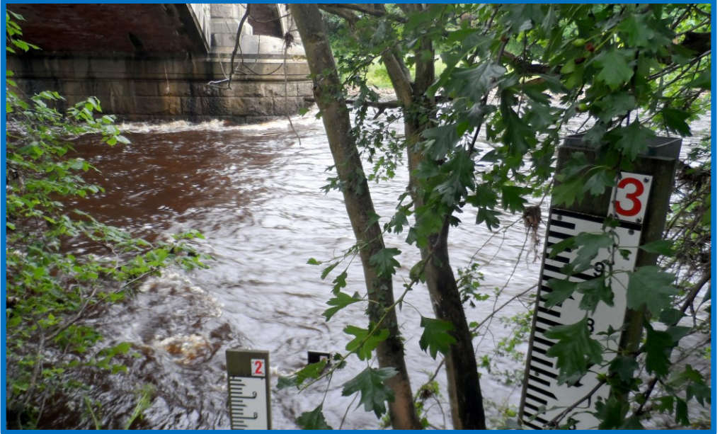
The River Level Recording Station, Warden Bridge River South Tyne

Encouraging Enabling Challenging in the Tynedale Methodist Circuit