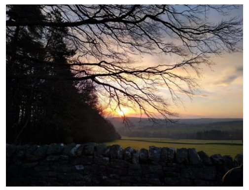
Sunrise over the Allen Valleys