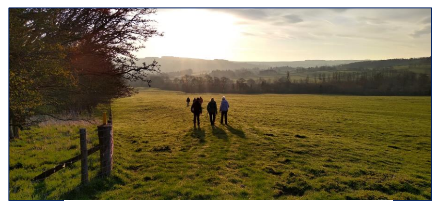
Keenley to Catton