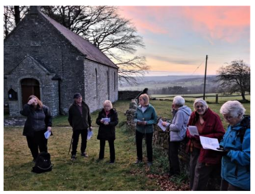
Christ the Lord is risen today, Allelujah!