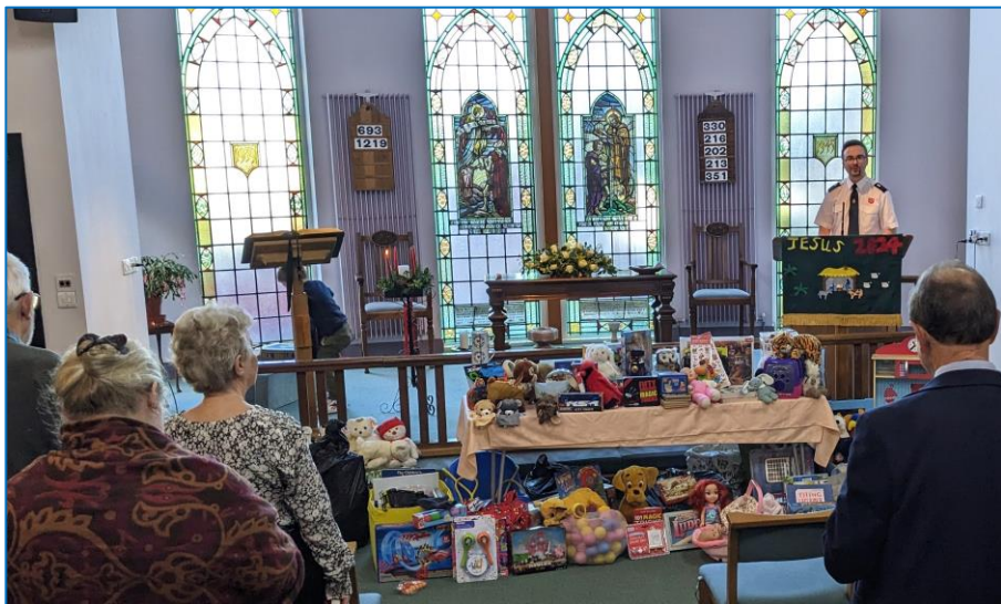
Haydon Bridge Annual Toy Collection for Hexham Salvation Army