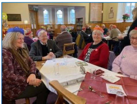
Some beneficiaries of the Catton Community Lunch, December 2022