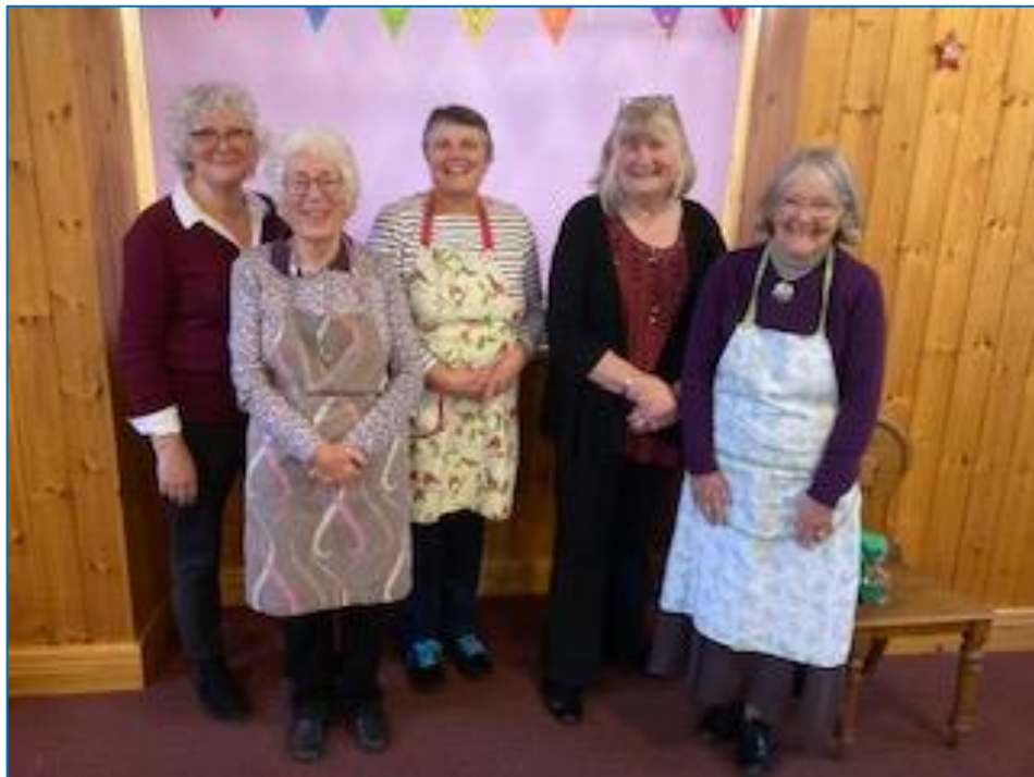
The Catton Community Lunch Club Volunteers

Catton Chapel lunches are on the first Thursday of each month at 12.30pm. We offer a 2 course meal, cooked in the Chapel with tea/coffee to follow. No set charge but donations accepted. The local GP practice has been informed of our service and we are about to contact the Carer agencies also. Although our initial volunteers have reduced over the years we have been able to recruit replacements from our local community.